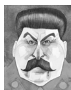
Napoleon is Stalin.

In November 1917 the King of Russia was killed. His family was also killed. Mr Jones is chased away from Manor Farm. In 1921, Russia changed its name to the Soviet Union. The animals changed the name of Manor Farm to Animal Farm.