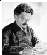
Snowball is Trotsky.

A lot of Russian people had meetings. They wanted to get rid of the King. In Animal Farm the animals wanted to get rid of Mr Jones. Two very important people in Russia were Trotsky and Stalin. They planned to get rid of the King.