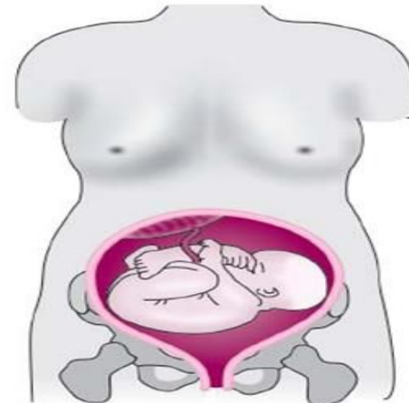
Transverse lie shoulder presentation