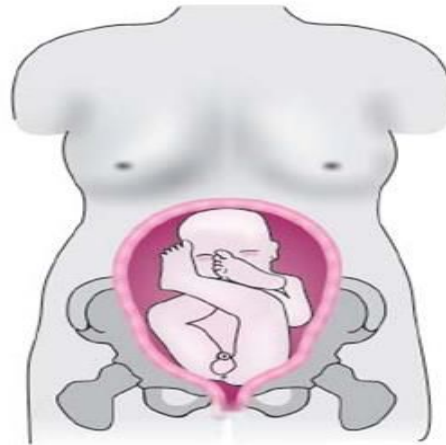
Longitudinal lie Breech presentation