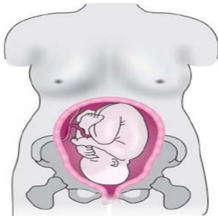
Longitudinal lie Vertex presentation